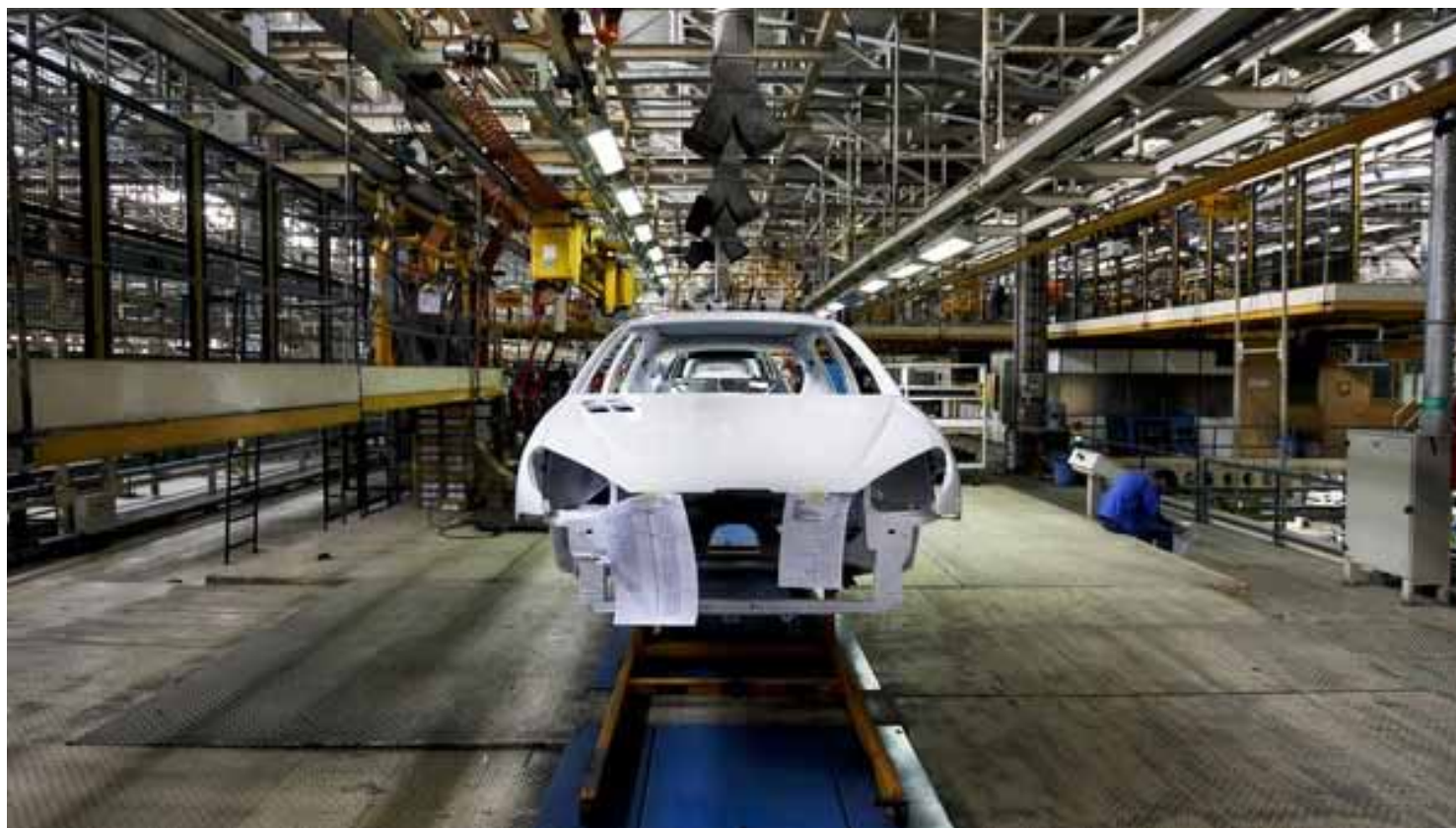
Made in Tehran: an unassembled Peugeot 206 sits in the Iran Khodro auto plant